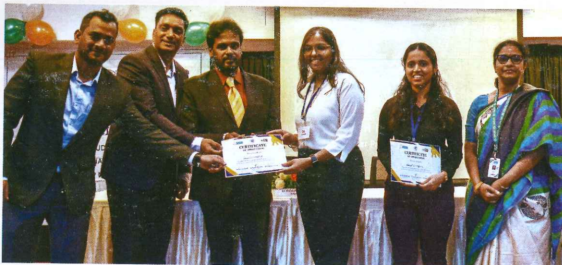
Enigma - event by Computer Engineering Department-