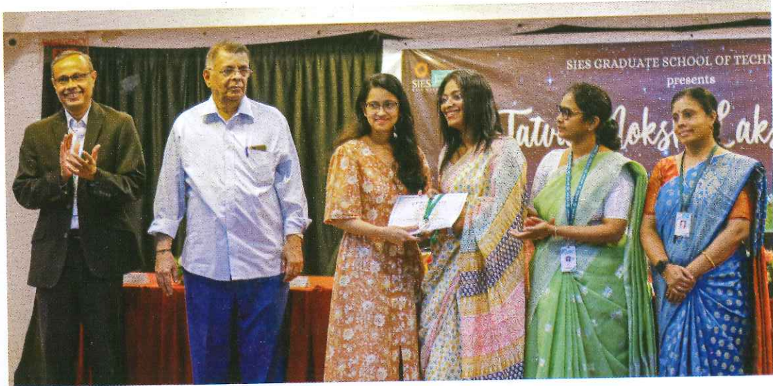
TATVA MOKSH LAKSHYA (TML) Annual Cultural Technical & Sports fest

SIESGST. The theme for this year's festival was 'Mayanagari' and the college was decorated with theme related creative work.