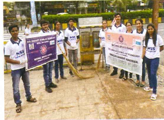
Cleanliness Drive outside SIES Campus

drive, spearheaded by NSS volunteers, was to contribute to the overarching mission of ensuring a clean and open-defecation-free India while addressing issues of litter and unhygienic conditions.